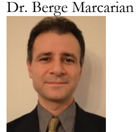
Sub-specialty: Endoscopic Sinus Surgery

Contact Information: 520 Ellesmere Road, Suite 401 Scarborough, ON M1R 0B1 Office: (416) 673-9393 Fax: (416) 673-9394